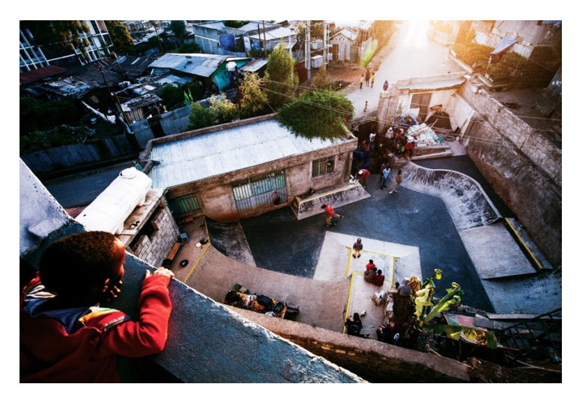
The morning after completion of the concrete work.

skateboarding and movement. A female side of the organization has also been established, not as long ago, focusing only on girls and young women. The leader of the community is Muluken Dejene, who focuses likewise on skateboarding activities but also dance and singing. We were able to witness an amazing performance at the opening ceremony, after cutting the ribbon. As originally planned the centre is currently hosting a safe space for men but also women who can use the space as their community centre. Where their activities are divided in certain days and certain hours, it also comes to an interaction between the male and female fractions of the organization which helps create a healthy relationship between not only people of different ages and religions, but most importantly genders – which continues to be an ongoing issue in Ethiopia and perhaps Eastern Africa in general.