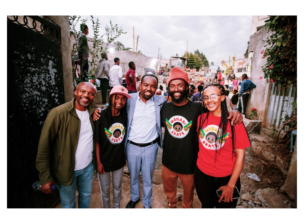
Megabi skate leaders.