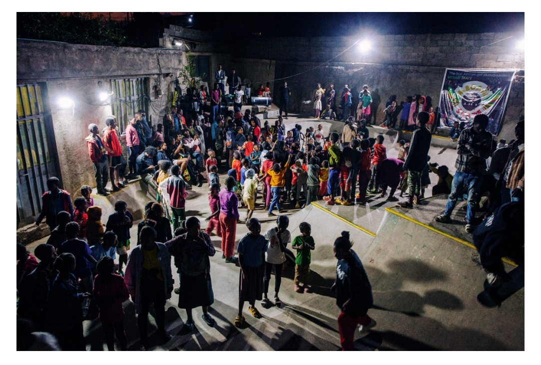
Opening celebration at the evening hours.