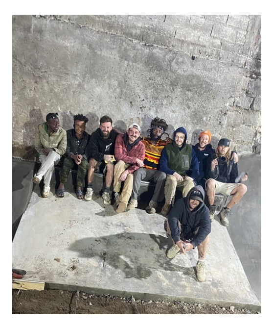
Our team with some of the local apprentices.

It is important to mention that we have not stopped the communication with our previous partner Ethiopia Girl skate. We have donated a couple of concrete tools and we have also donated a couple of skateboards so that they can further improve their activities. In the future we shall further help create a closer bond between the two organizations under the idea that unions are always stronger, which is after all the very idea of our projects.